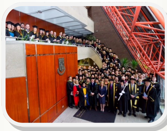
PDMT Class 2016—240 graduands

The delivery of the programme involves a consortium of Higher Education Institutions (HEIs) led by the National Centre based at the University of Limerick. The professional diploma is delivered nationally in a blended learning format.