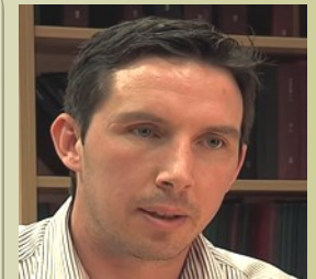
(Teacher from Cohort 1)

As a fully qualified Business Studies teacher I was keen to get an additional qualification in mathematics and this part time programme gave me that opportunity...The blended learning format is very flexible.