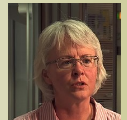
(Teacher from Cohort 1)

With the introduction of Project Maths there was a need to upskill with pedagogy...This is a fully funded course paid for by the Department of Education so there was no extra financial burden.