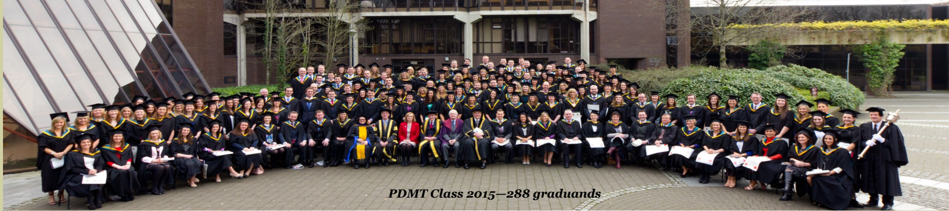
PDMT Class 2015—288 graduands